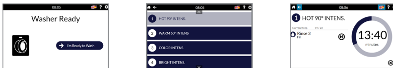
XControl FLEX PLUS approach, program, and cycle screens